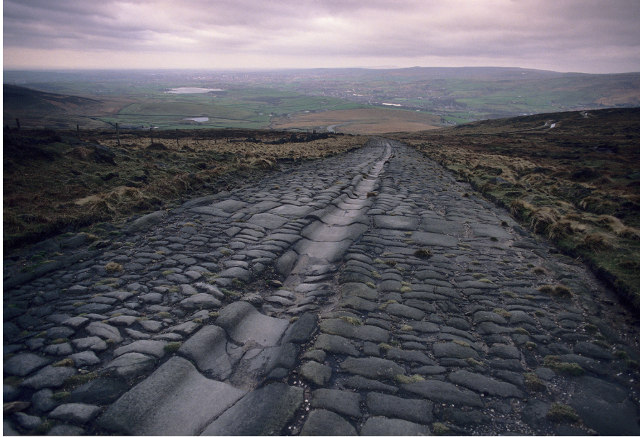
Source F: The remains of a Roman road at Blackstone Edge, Manchester