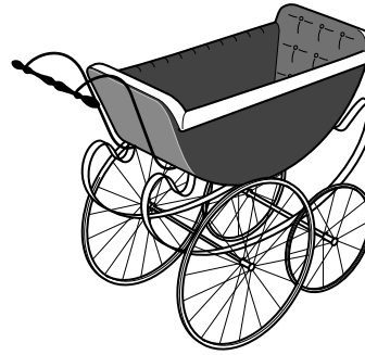
pram from 1900