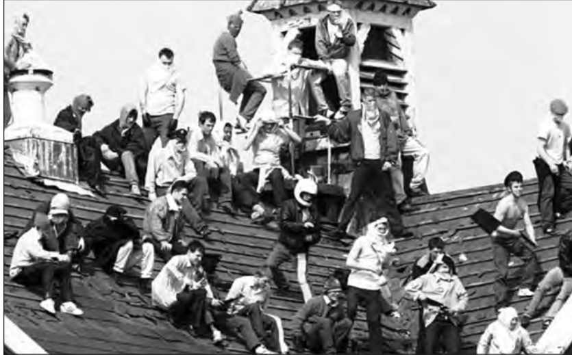
[A riot caused by poor conditions at Strangeways prison Manchester in 1990]

Look at these two sources about punishment in the twentieth century and answer the question that follows.