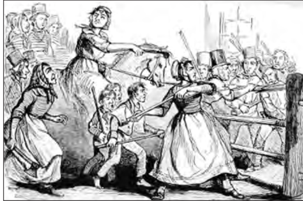
[An illustration of the Rebecca Rioters attacking a toll gate]

Look at these two sources about unrest leading to crime in the nineteenth century and answer the question that follows.