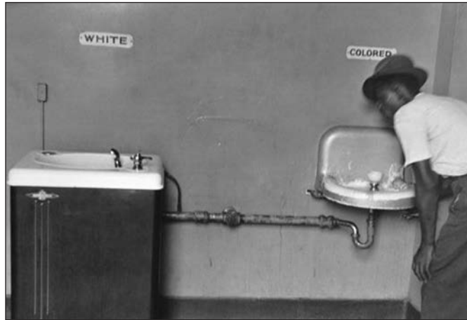
[A photograph of a segregated drinking fountain in the 1930s]

Look at these two sources about racial inequality in America and answer the question that follows.