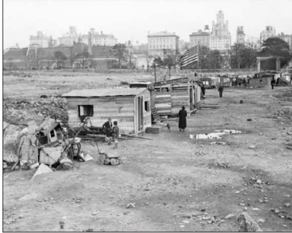
[A photograph of a 'Hooverville' in the early 1930s]

Look at these two sources about the economic downturn and recovery and answer the question that follows.