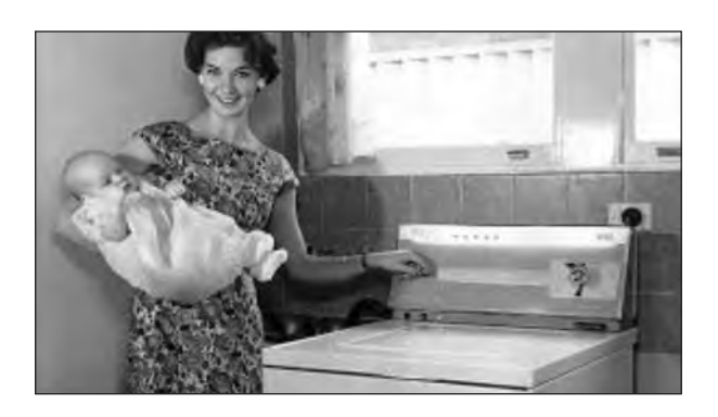
[A photograph of a young American woman in the 1950s]