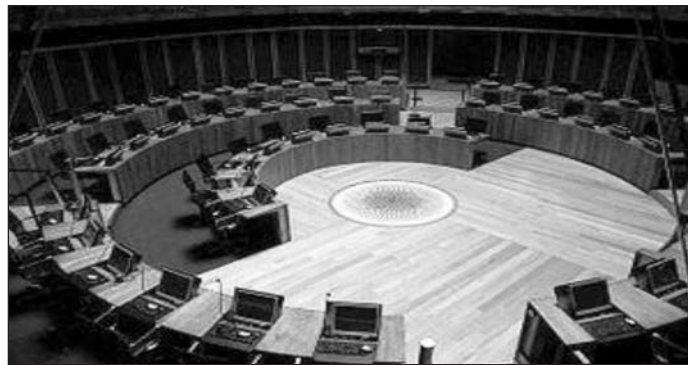
[The Senedd Chamber in the Welsh Assembly established in 1999]