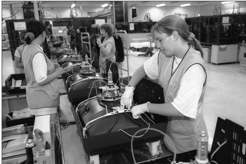
[Workers making television sets in a South Wales factory in the 1970s]