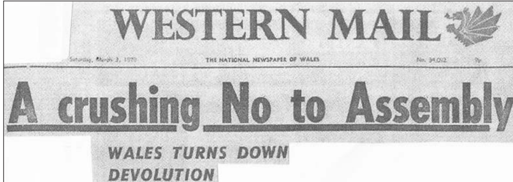
[Front page headline from the Western Mail, 3 March 1979]